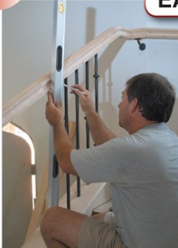
1. Check for plumb of baluster length and placement.