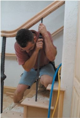
7. Install baluster into epoxy filled holes and press in for tight fit.