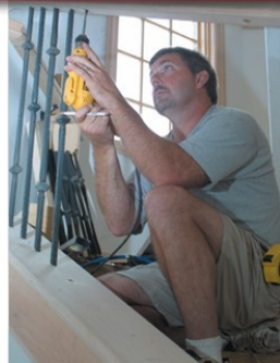
3. Cut round hole in bottom of handrail for baluster.