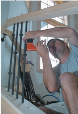
5. Apply epoxy in hole for baluster on top.