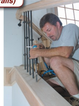
4. Square off bottom hole with air hammer/chisel and mortising bit without the drill inside. (For installation of square balusters without needing shoes)