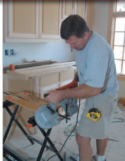
2. Cut baluster to length.