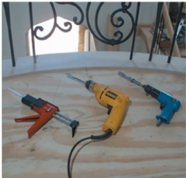
TOOLS USED: Standard Electric Drill, Air Hammer/Chisel, Epoxy Gun

Powder Coated Wrought Iron and Wood Newel Posts ordered in error may be returned (Freight Pre-paid) for credit within 30 days less a 30% restocking charge.