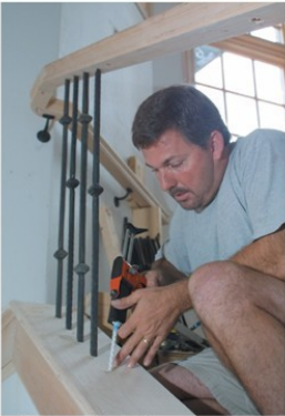
6. Do same for bottom.